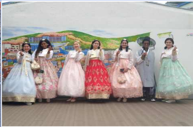
Trip to Gamcheon Culture Village