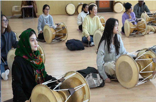
Learning Korean Traditional Music

( https://www.facebook.com/story.php?story_fbid=2332266053829990&id=100011398555202&mibextid=WC7FNe )