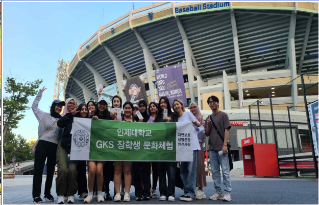
Korean Baseball Game at Sajik stadium

( https://www.facebook.com/100005784756066/posts/2233126293556841/?mibextid=rS40aB7S9Ucbxw6v )