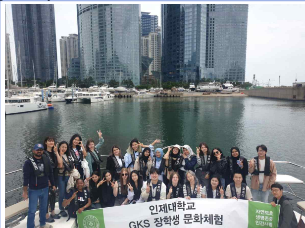
Yacht Tour( https://www.instagram.com/reel/C1Gg_jlvCqY/?igsh=ZWl2YzEzYmMxYg== )