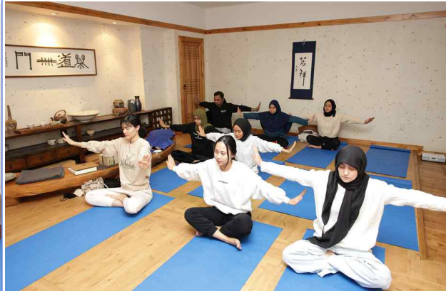
Tea ceremony and Yoga class